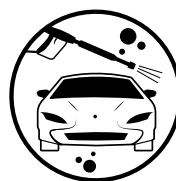
Self-service car wash systems