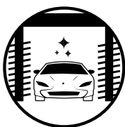
Tunnel car wash systems